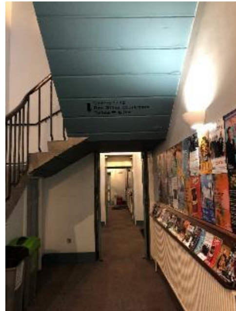
View along the Corridor towards the Box Office