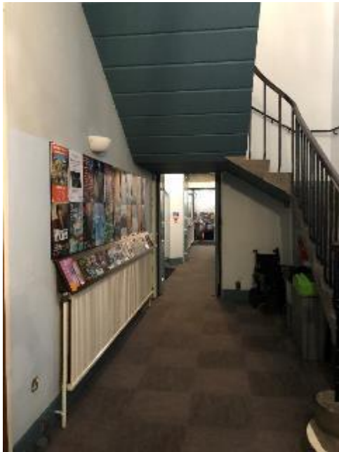
View along the Corridor from the Box Office