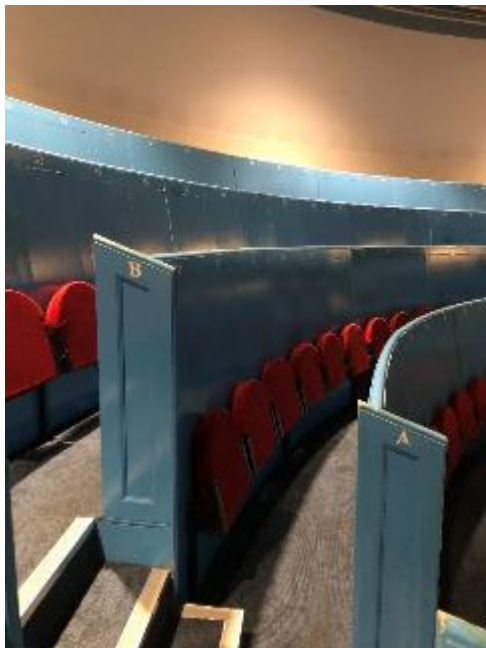
Gallery seating which flips down