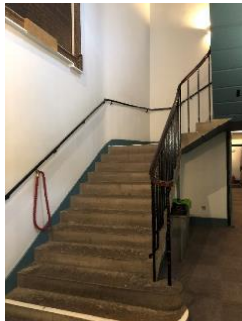
Stairs to the Gallery

Staff are available to help during your visit. If you have any questions you can ring us on Telephone: +44 (0)131 668 3456 Or email us directly at our Email: info@queenshalledinburgh.org