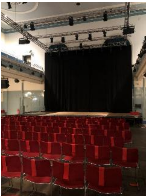
The centre stalls set up in rows, looking towards the stage