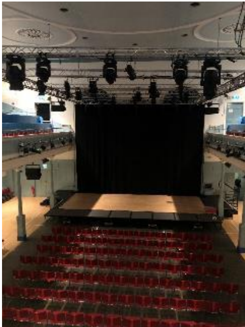
View of the Auditorium from the Centre Gallery