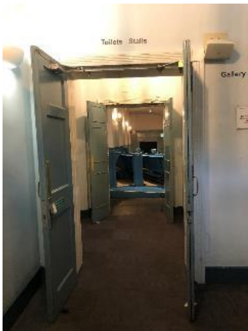
One of the doors into the Auditorium from the front Corridor