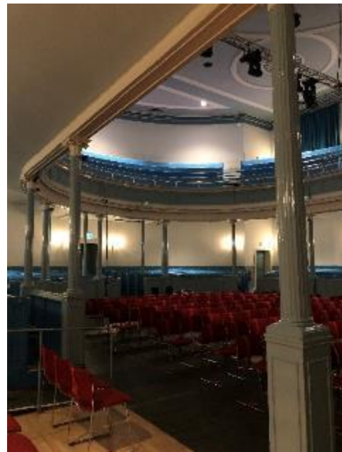
View of the Auditorium from the entrance closest to the Bar. This shows some of the pillars that can affect sightlines