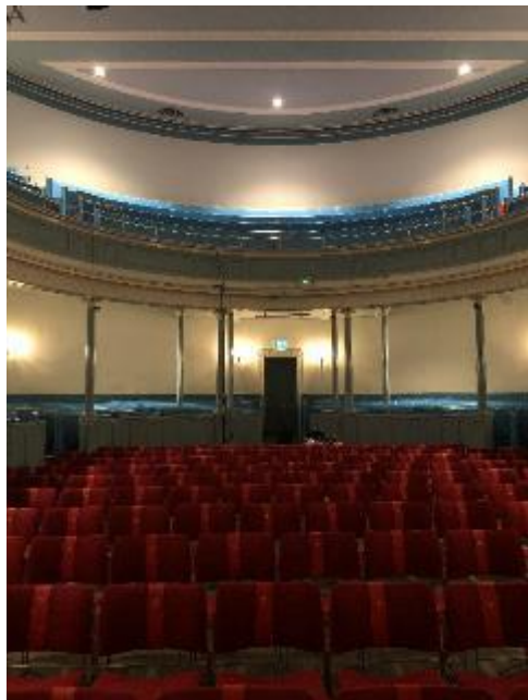
The centre stalls set up in rows, looking from the stage