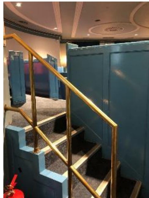
Steps up to the Centre Gallery

Staff are available to help during your visit. If you have any questions you can ring us on Telephone: +44 (0)131 668 3456 Or email us directly at our Email: info@queenshalledinburgh.org